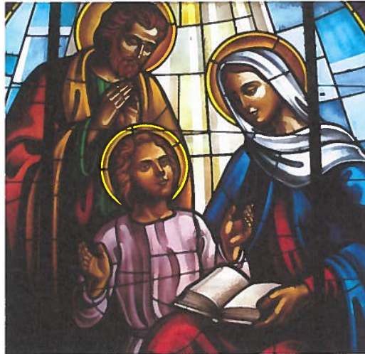
HOLY FAMILY // IMMACULATE CONCEPTION CATHEDRAL, EAST TIMOR