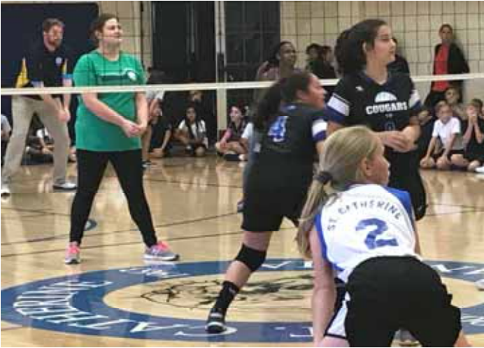
At our fall Spirit Rally, the 8th graders played the faculty/staff in volleyball. It was a lively game. The 8th graders won 25-23.