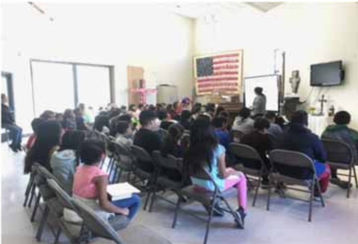
Clase de Ambiente Seguro para los niños.

En las últimas semanas, el programa de catequesis ha tenido diferentes clases. En estas clases todos aprendemos algo nuevo para seguir creciendo en nuestra Fe. Invitamos a los padres de familia a que pasen a los temas semanales los sábados a las 9:15am en el centro Milani.