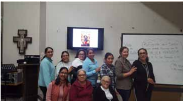
Grupo Mujer de Fe sigue creciendo Construyendo lazos de Fe, Amor y Esperanza.