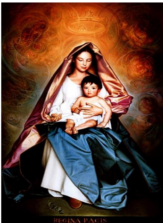
Happy Mother's Day! ¡Feliz Día de las Madres