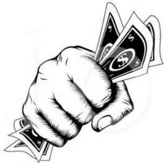
illustrations of.com #1147534