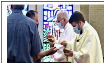
Spiritual Communion Prayer

As the summer days get hotter, please remember to dress appropriately for Mass. The Dispensation of the Sunday Mass has been extended through the Month of July.