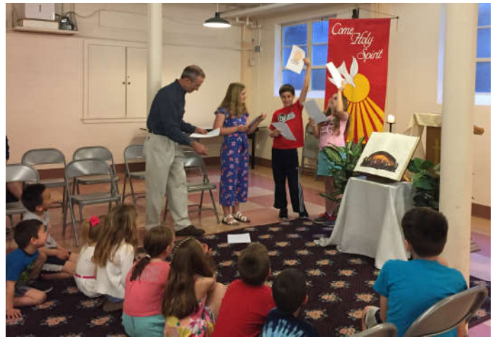
A joyful picture to see the children inspired by the Holy Spirit as they act out last Sunday's Gospel on Pentecost during Children's Liturgy of the Word (CLOW).