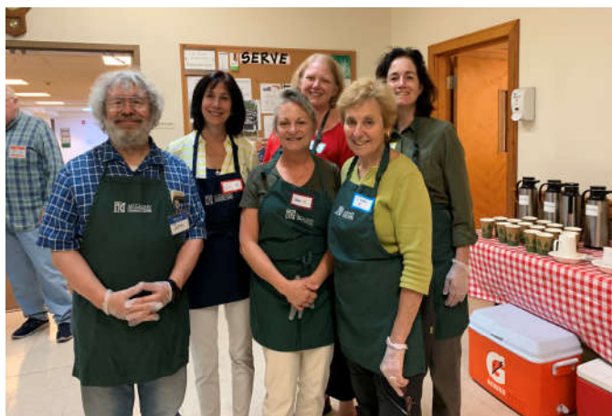
Adult Christian Service Ministry at Acton Community Supper