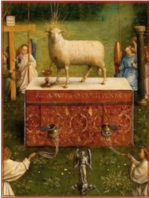
“Behold the Lamb of God, who takes away the sin the world.” John 1:29

3520 E. 18th Avenue Spokane, WA 99223 509.534.2227 www.stpeterspokane.org stpeter@dioceseofspokane.org