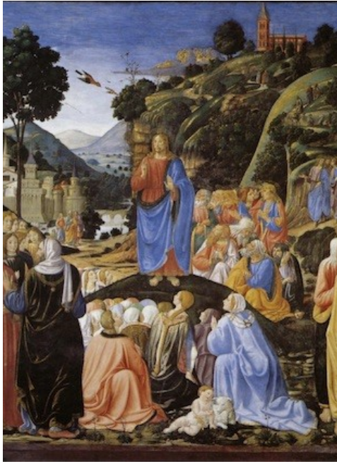
“Blessed are you, Father, Lord of heaven and earth; you have revealed to the little ones the mysteries of the Kingdom.”

3520 E. 18th Avenue Spokane, WA 99223 509.534.2227 www.stpeterspokane.org stpeter@dioceseofspokane.org