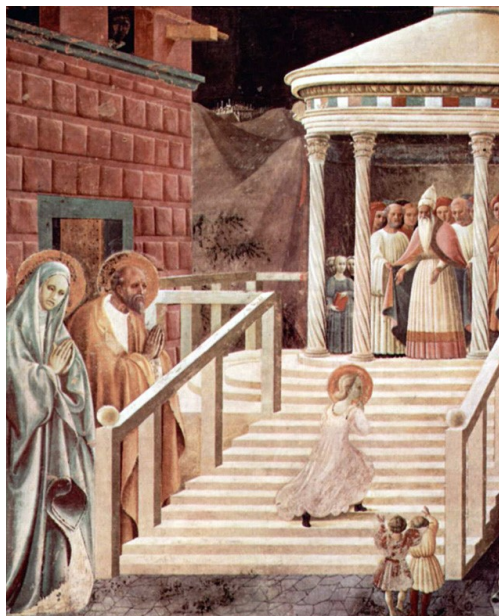
“Praise the Lord our God, for in Mary his handmaid he has fulfilled his promise of mercy to the house of Israel.”

3520 E. 18th Avenue Spokane, WA 99223 509.534.2227 www.stpeterspokane.org stpeter@dioceseofspokane.org