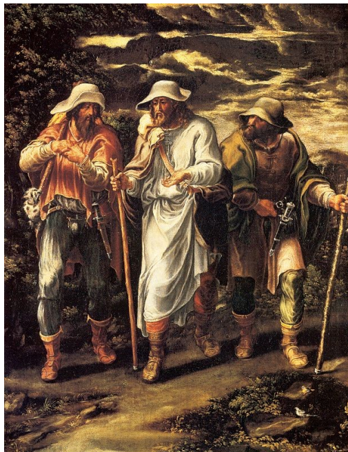
“The two disciples recounted what had happened on the road to Emmaus and how they had come to know Jesus in the breaking of bread.”

3520 E. 18th Avenue Spokane, WA 99223 509.534.2227 www.stpeterspokane.org stpeter@dioceseofspokane.org