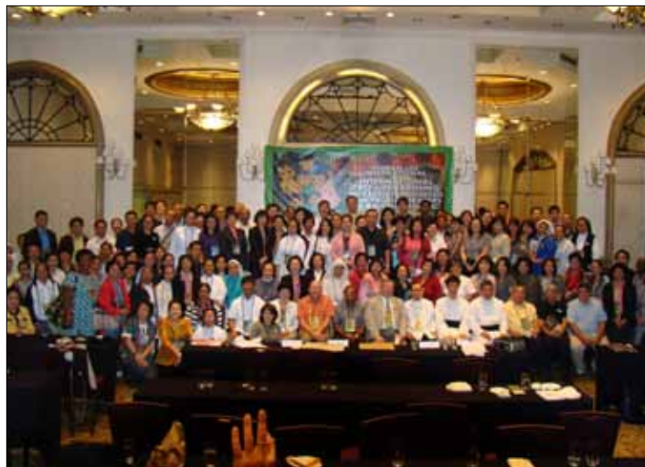
Speakers and participants at the International Pro-Life Training for Clergy, Religious and Pro-Life Leaders of Asia and Oceania.

which left the participants spellbound. With all the participants proudly wearing their respective country's colourful traditional costumes on opening day, it was a sight to behold. The entrance of colors, enhanced by the beat of drums and the play of lights, was met with thunderous applause, as each country's representative proudly waved his or her flag and planted it on stage, signifying their unity with Human Life International in the mission to defend Faith, life, and family all over Asia, Oceania, and the world.