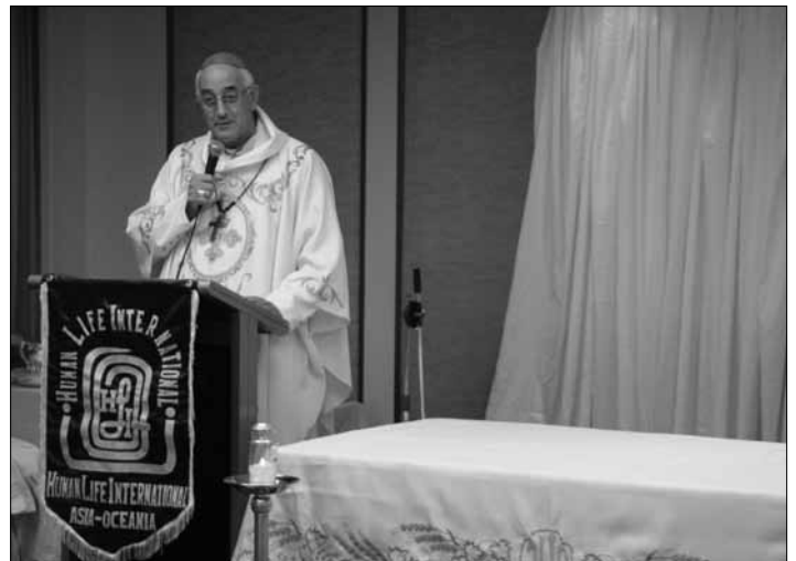
Archbishop Francesco Panfilo, President of the Catholic Bishops Conference of Papua New Guinea and Solomon Islands.