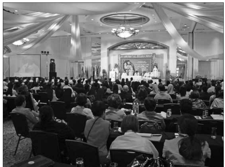
His Eminence Gaudencio Cardinal Rosales, delivering a powerful homily at the closing Mass of the 17 th Asia-Pacific Congress.