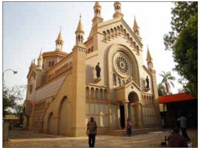
A Cathedral threatened with demolition.