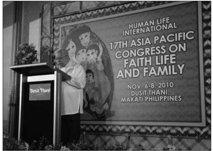
His Eminence Ricardo Cardinal Vidal of the Philippines delivering his keynote speech.

The event was held in cooperation with the Catholic Bishops Conference of the Philippines; the Couples for Christ Foundation for Family and Life (CFC-FFL); the Knights of Columbus; and the Family Media Advocacy Foundation, who selflessly helped in all the activities. Priests and nuns and many intercessory groups continuously offered Masses and prayers for the success of the Congress – the prayers were definitely heard. Truly God is good and God is great! When we totally surrender and offer our plans to Him, He definitely blesses us and makes the impossible possible.