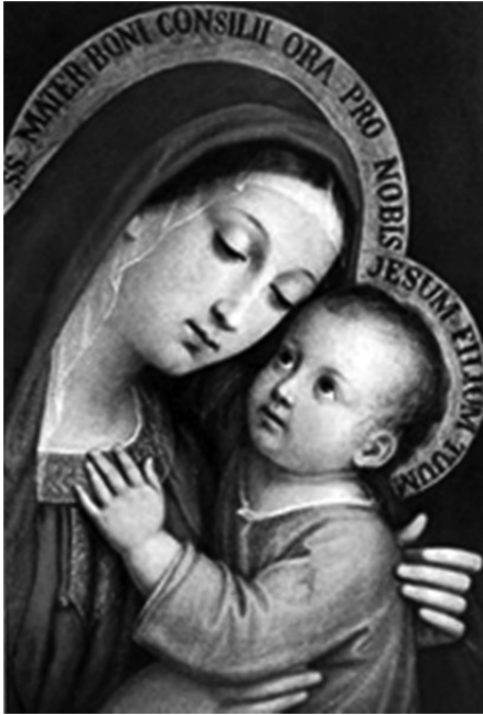
Our Lady of Good Counsel – Patron Saint