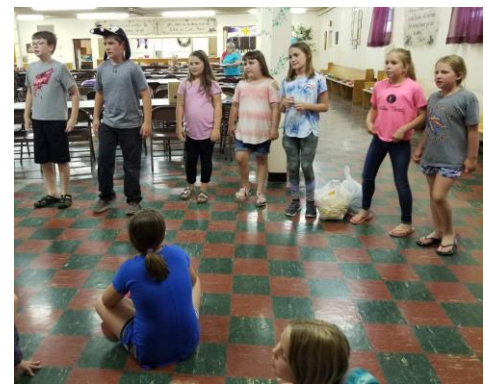
LIFE IS WILD ~ GOD IS GOOD!!