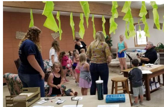
Snack Time with Music