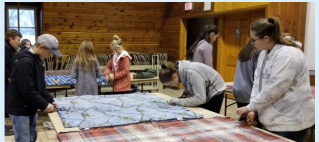
Making Tied Blankets Service Project