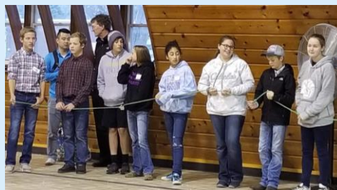
Praying the Living Rosary with a giant Rosary