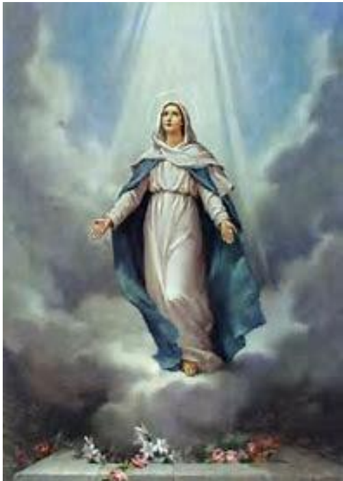
The Assumption of the Blessed Virgin Mary August 15 th