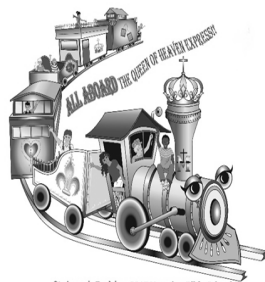
St. Joseph Parish - 2017 Vacation Bible School

Join us Saturday, April 8th at 10 AM at the Memorial for the Unborn, in the courtyard of OLMC to pray the Rosary.