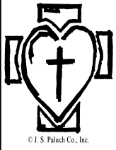
© J. S. Paluch Co., Inc.