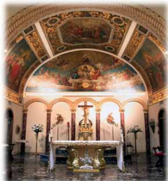
St. Ann, our Parish Patroness, pray for us!