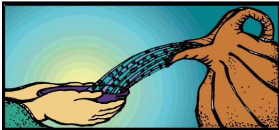
© J. S. Paluch Co., Inc.