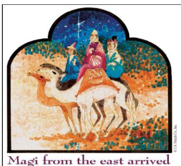
Magi from the east arrived

Gospel — The magi were overjoyed at seeing the star.