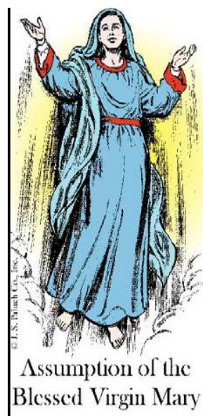
Assumption of the Blessed Virgin Mary