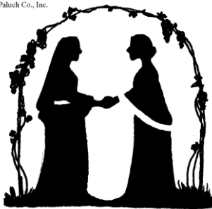
Visitation of the Blessed Virgin Mary