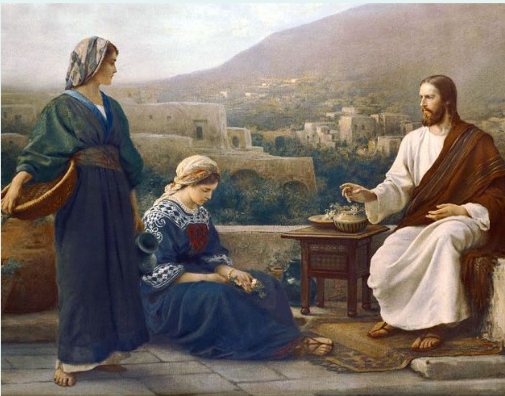
Martha, Mary, and Jesus [Artist unknown]

THE NEWS-BULLETIN FOR THE TRIPARISHES OF ST. JOSEPH, IMMACULATE HEART OF MARY, ST. FRANCES XAVIER CABRINI