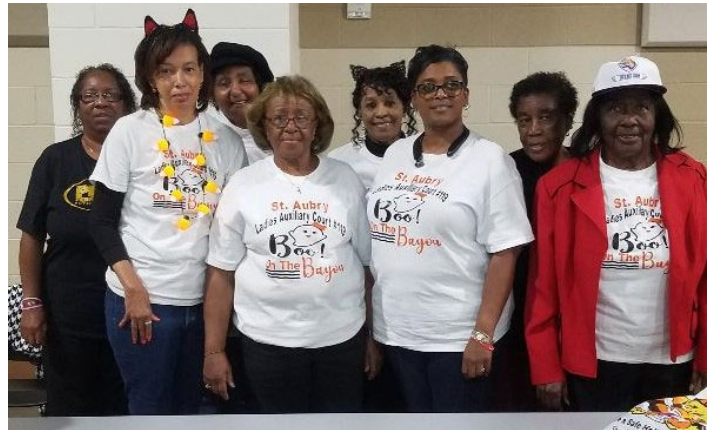
Boo on the Bayou