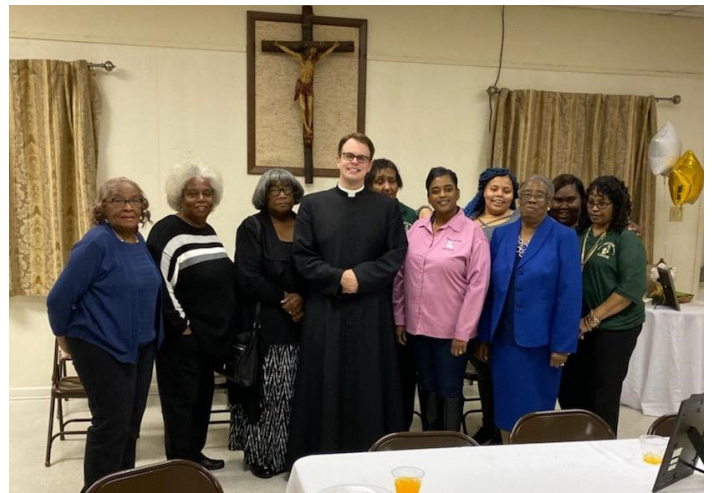
Priest Appreciation Reception

RECONCILIATION (CONFESSION) is celebrated at Immaculate Heart of Mary on Saturday from 3:00—3:45pm. If you'd like to celebrate the Sacrament of Reconciliation outside the scheduled time, please call the office to arrange a time with the priest.