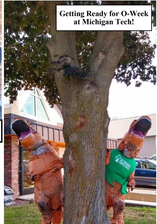
Getting Ready for O-Week at Michigan Tech!