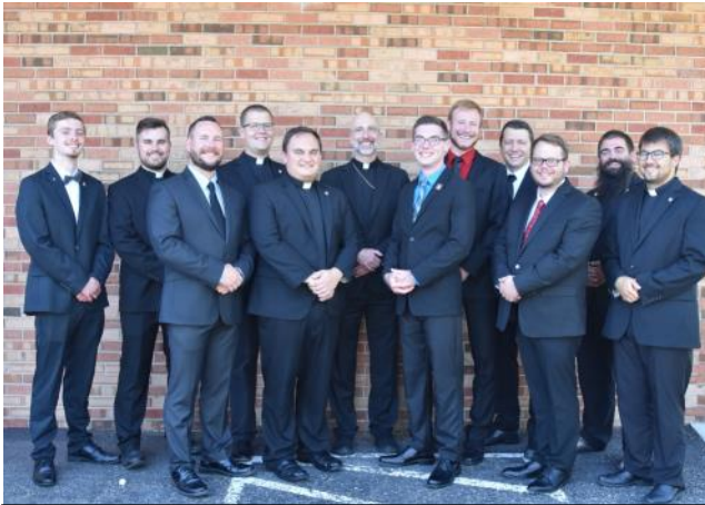
The new group shot for our 10 seminarians! Please pray for these good men as they prepare for a new school year

Sun. AUGUST 23 Twenty-first Sunday In Ordinary Time Is 22:19-23 Rom 11:33-36 Mt 16:13-20