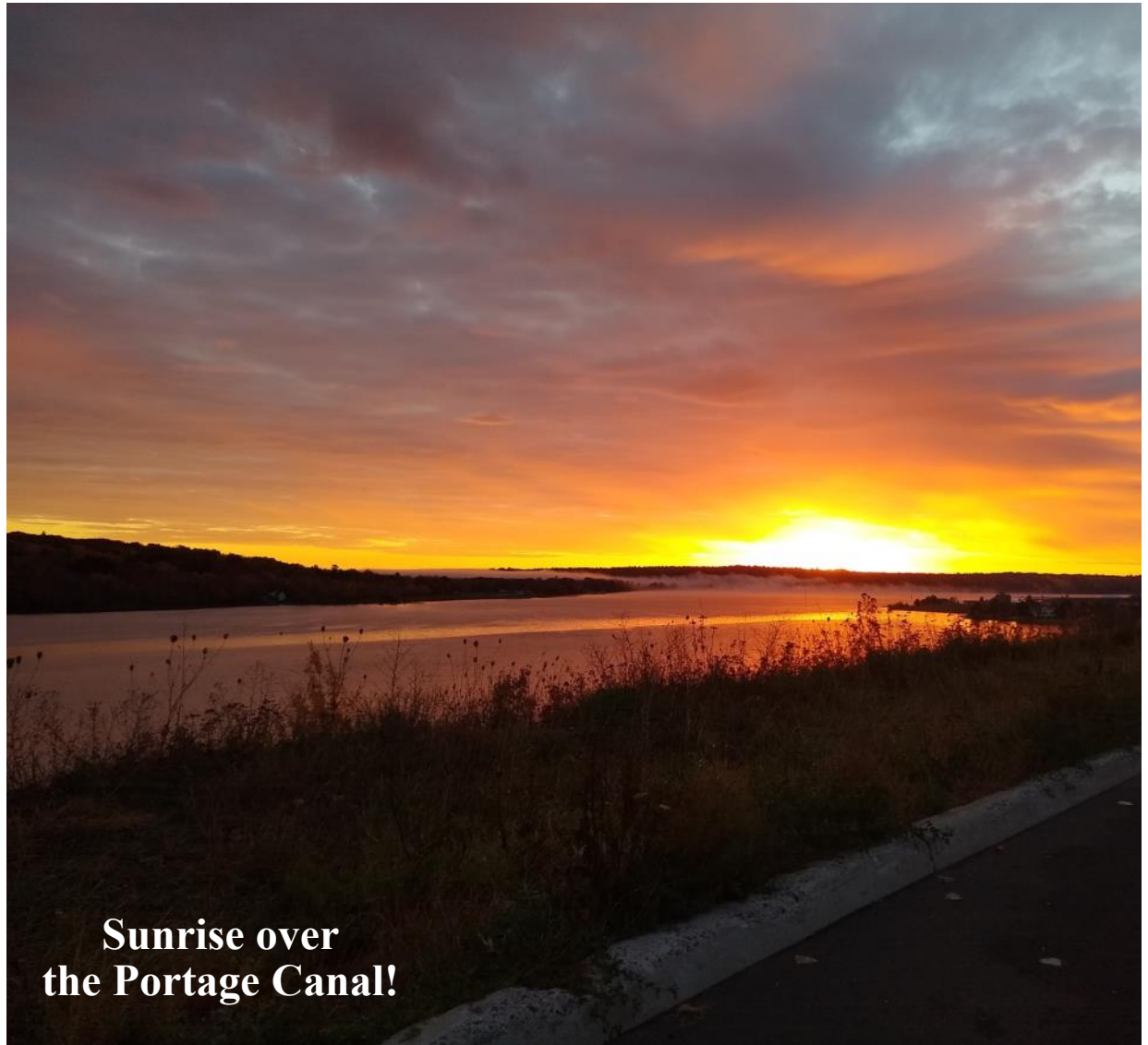
Sunrise over the Portage Canal!

Thirtieth Sunday in Ordinary Time Ex 22:20-26 1 Thes 1:5c-10 Mt 22:34-40