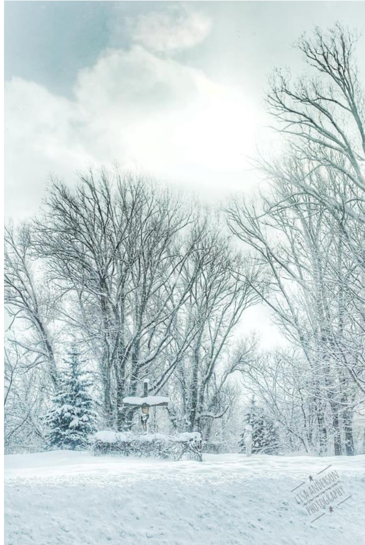
Beautiful photo of St. Anne's Shrine !

Second Sunday of Lent Gn 22:1-2, 9a, 10-13, 15-18 Rom 8:31b-34 Mk 9:2-10