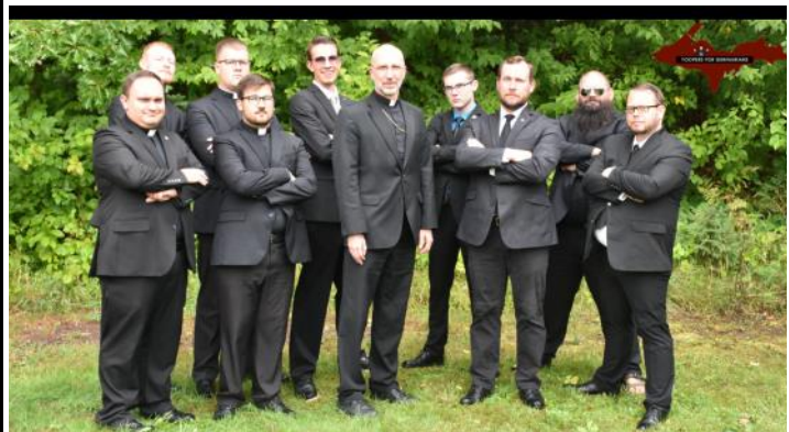
Men in Black 2021

We had some fun with the new Yoopers for Seminarians magnet, too!