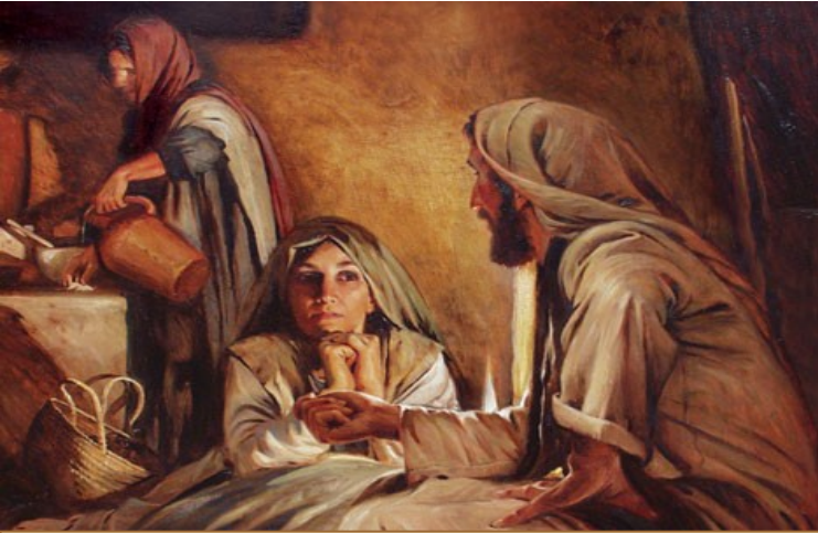
Martha and Mary welcome Jesus as a guest in their home.

July 20 th and 21 st : Building and Maintenance