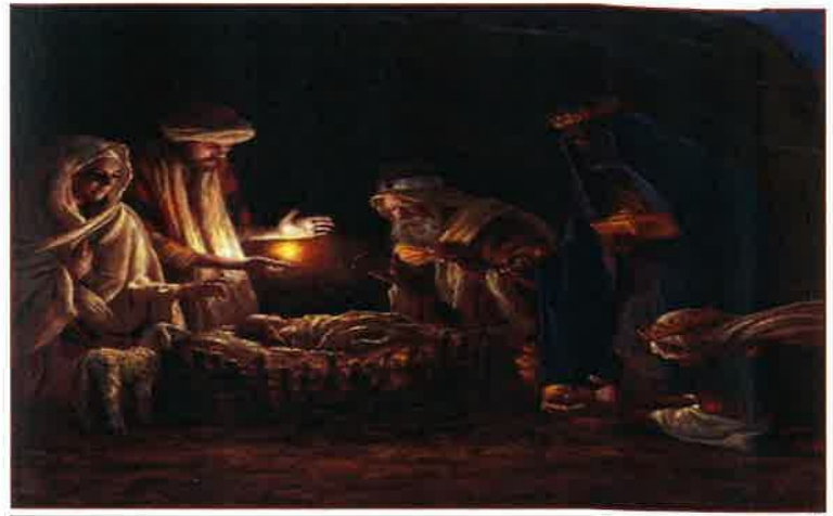
"Wise Men Still Seek Him."