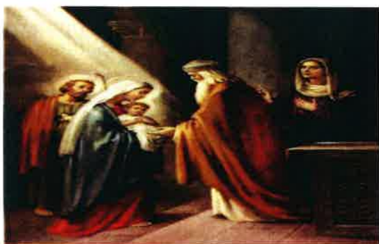
Feast of the Presentation of the Lord

The next Parks Family Fest committee meeting will be held on Thursday, February 13 th at 6:15pm at the KC Hall. If you would like to volunteer or assist in any capacity for the Family Fest, you are more than welcome to attend this meeting.