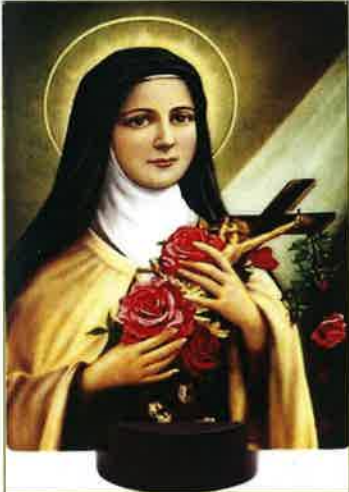
St. Therese of the Child Jesus Pray for Us!