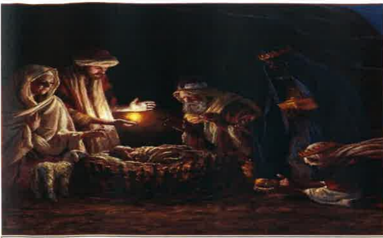
Wisemen Still Seek Him