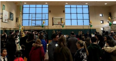
Open House Sunday!