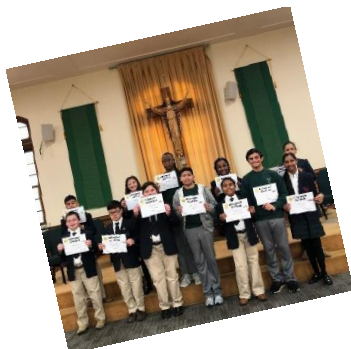
Math and Spelling Bees!