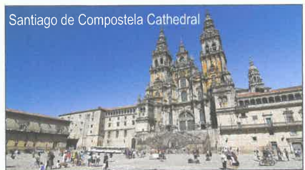
Santiago de Compostela Cathedral

*There is an optional add-on extension to this pilgrimage to Fatima, Portugal April 29- May 2 for only $433 additional.