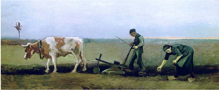
June 16, 1850. A F.-X. Libermann.

Be before him (God) as the earth before the ploughman; he turns it, turns it around, turns it around, breaks it and works it in all directions; it lets him do so; do the same before God, who is ploughing you at this time; he will destroy all the weeds and dispose you by this way to true virtue (L.5., IV, 616 and N.D., XII, 232).