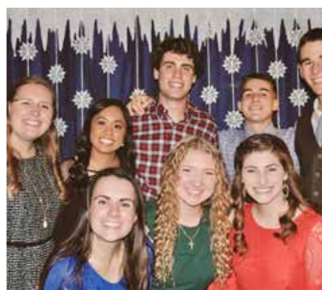
The Catholic Student Association (CSA) held its annual Christmas Coffee December 1.