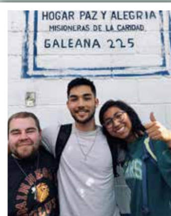
Students on mission with FOCUS in Mexico over spring break.