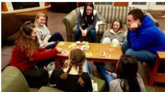
Students enjoying games for the CSA's game night on March 1.