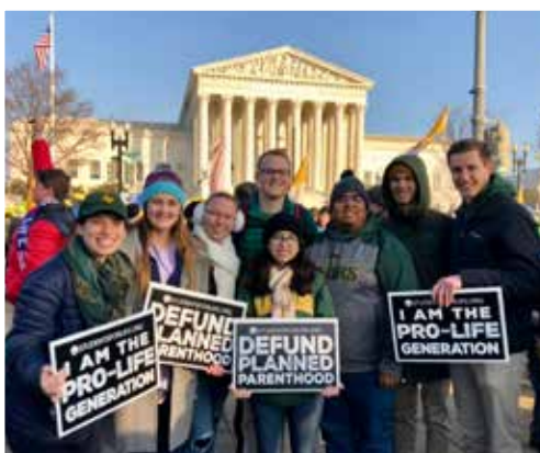
March for Life in Washington D.C.: On January 18, eight Baylor Catholics joined upwards of 200 thousand people in the National March for Life.