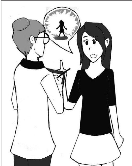
Some near-death experience details can't be observed or verified by someone else