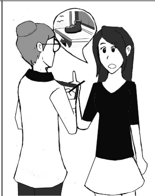
Veridical Data: Details that can be verified by someone else

She found that the veridical data was reported more accurately by the clinically dead than by the other people in the hospital room. In some cases, the details being reported and independently verified involved distant or inaccessible areas of the hospital, or conversations overheard while the brain was being actively monitored and failing to register activity.