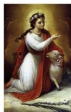
Prayer to Saint Agnes January 21, 2021

Feast Day of the Patroness of the Diocese of Rockville Centre.