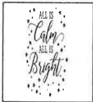
6 SIZE: 14x18