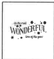
8 SIZE: 14x18