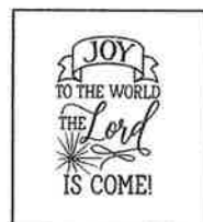
10 SIZE: 14x18