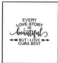
7 SIZE: 14x18