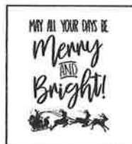
9 SIZE: 14x18