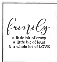
2 SIZE: 14x18