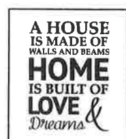
5 SIZE: 14x18