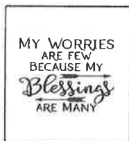
1 SIZE: 14x18

ALL PAINTING SUPPLIES INCLUDED [ BOARD CHOICES: PLEASE CHOOSE 1 ]