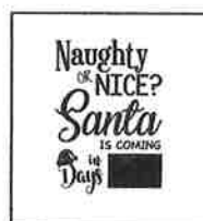
4 SIZE: 14x18