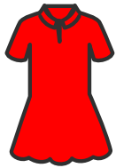
Red polo dress