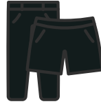
White or red polo with navy pants/shorts.