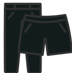
White or red polo with navy pants/shorts. No cargo shorts or pants. Boys should wear belt with shirts tucked in.