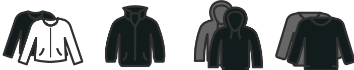
White/navy sweater or embroidered fleece (from Dennis) can be worn anytime. SAS hoodies and sweatshirts can be worn anytime except Mass.