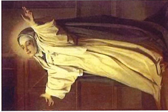
St. Catherine of Siena

St. Francis of Assisi —could talk to animals