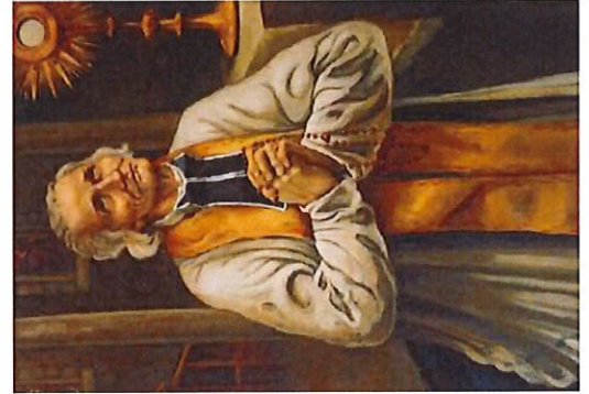
St. John Vianney