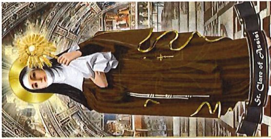
St. Clare of Assisi