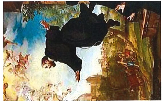
St. Joseph of Cupertino

St. Padre Pio —could bilocate (be in 2 places at the same time)