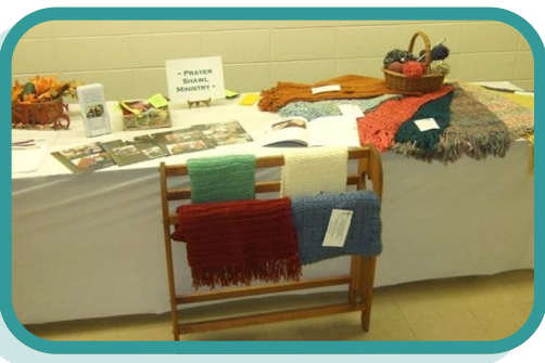
Prayer Shawl Ministry table at the St. Frances Cabrini Ministry Fair