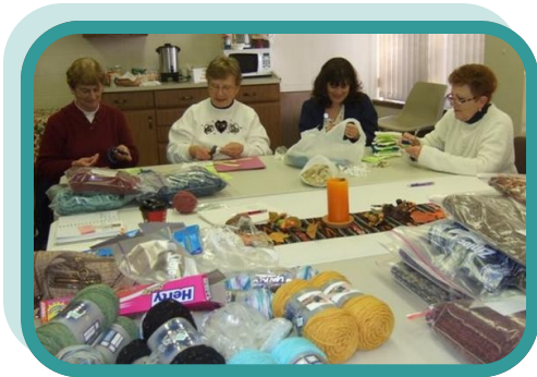
Prayer Shawls are prepared for distribution

These Shawls are never sold but are given upon request.