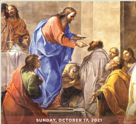
SUNDAY, OCTOBER 17, 2021