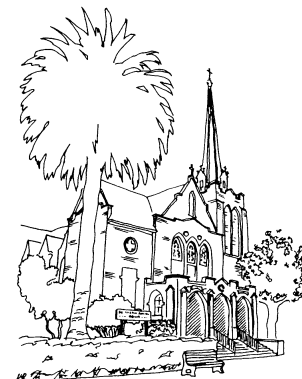
St. Thomas Aquinas Church