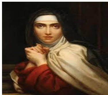
Theresa of Avila