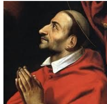
St. Charles Borromeo

CALL/EMAIL THE RECTORY TO REGISTER 215-463-4060 rectory@stgabes.org