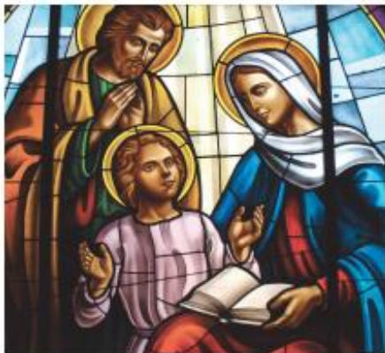
HOLY FAMILY / IMMACULATE CONCEPTION CATHEDRAL, EAST TAMPA / BISHOPCOMING