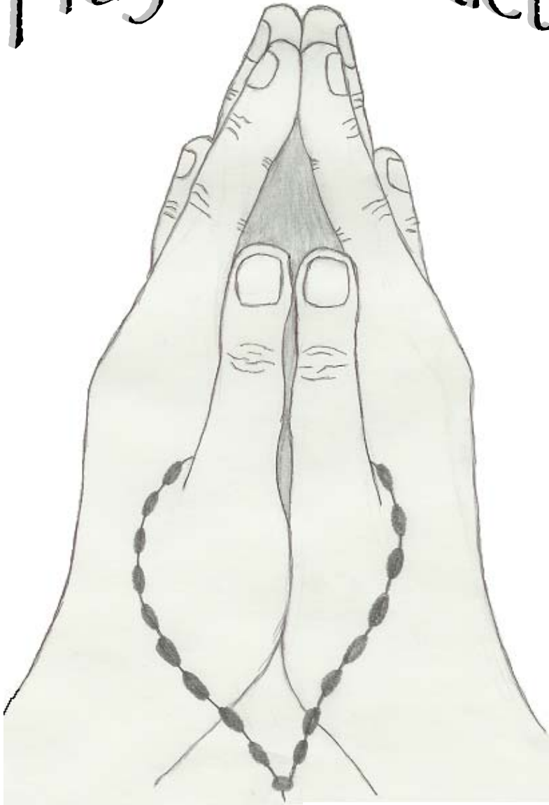
Drawing by Olivia Fries